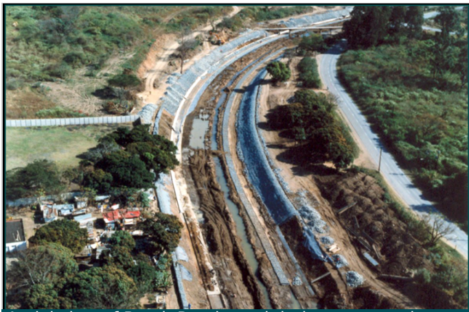
Aerial view of Booth Road canal during construction

Client: CATO MANOR DEVELOPMENT ASSOCIATION Designer / Consultant: DURBAN METRO Contractor: ERBACON Products used (Qty.) - Reno Mattress Unknown Date of construction: 12/1997 - 12/1998