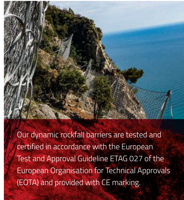
Our dynamic rockfall barriers are tested and certified in accordance with the European Test and Approval Guideline ETAG 027 of the European Organisation for Technical Approvals (EOTA) and provided with CE marking.