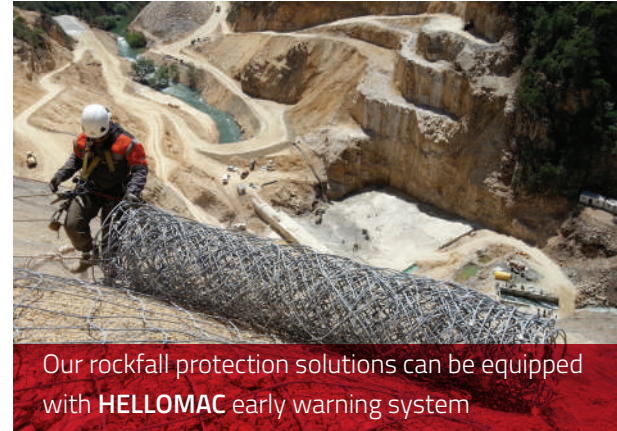
Our rockfall protection solutions can be equipped with HELLOMAC early warning system

Scalable to suit the hazard, embankments are used where large or repeated impacts are expected including landslides, rockfalls, and avalanches. Featuring reinforced soil technology, they can often re-use site won materials in their construction. Embankments can be designed to accept impact energy capacities of over 20,000kJ.