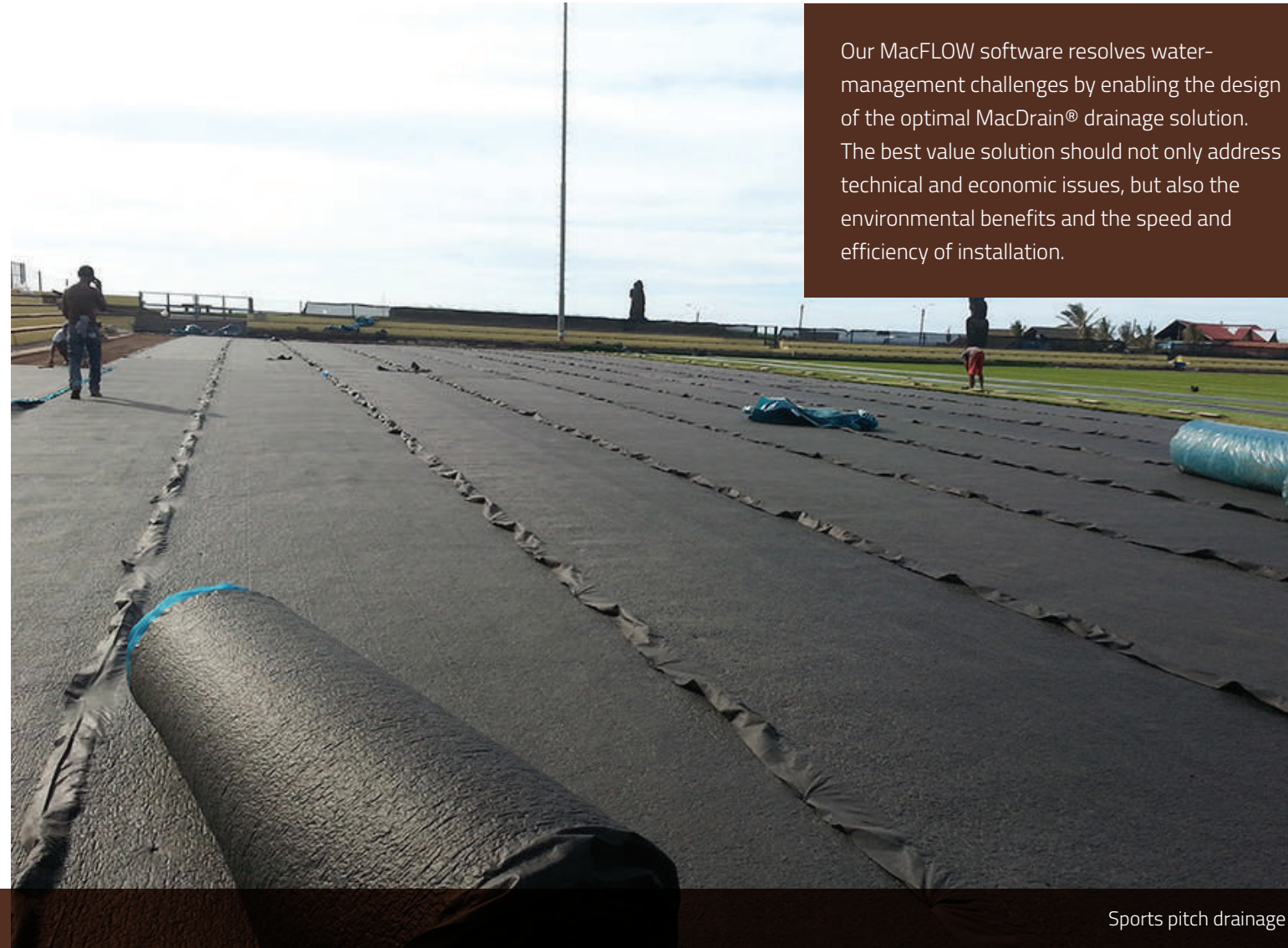
Sports pitch drainage

Our MacFLOW software resolves water-management challenges by enabling the design of the optimal MacDrain® drainage solution. The best value solution should not only address technical and economic issues, but also the environmental benefits and the speed and efficiency of installation.