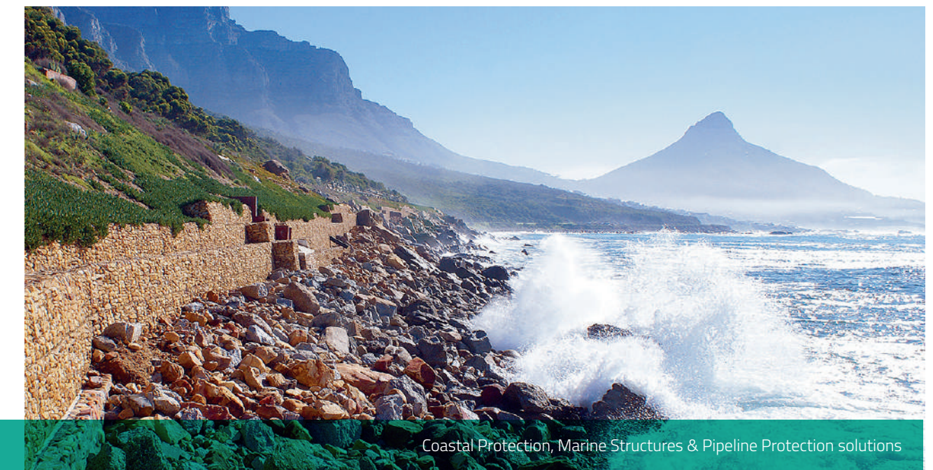
Coastal Protection, Marine Structures & Pipeline Protection solutions