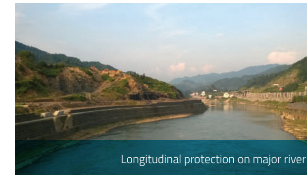
Longitudinal protection on major river

Our software is used to design channel protection and transverse structures. These enable the designer to rapidly perform preliminary hydraulic studies to evaluate the bank protection or the weir structure required.