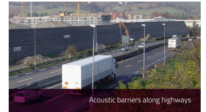
Acoustic barriers along highways