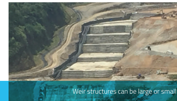
Weir structures can be large or small