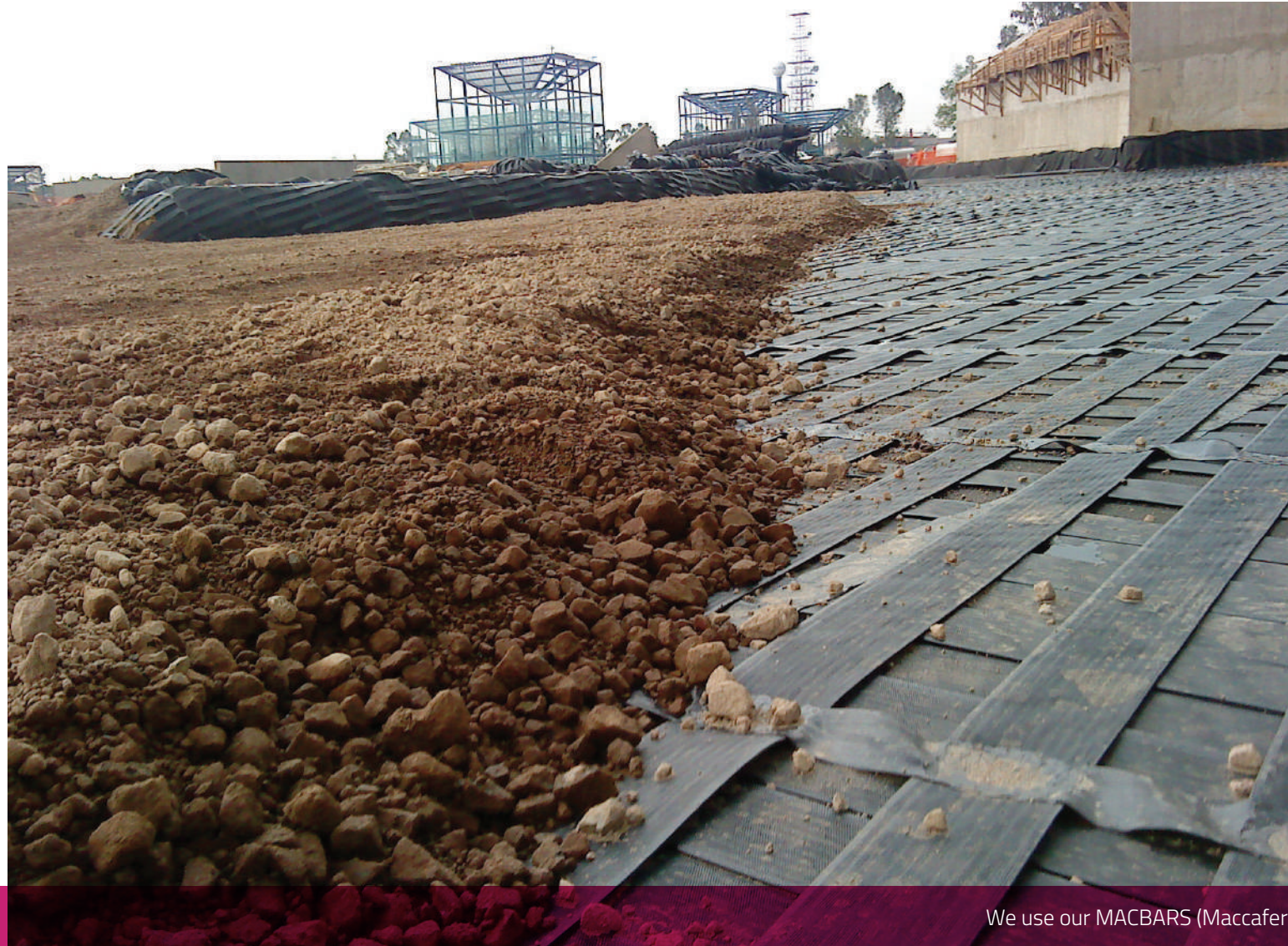
We use our MACBARS (Maccaferri Basal Reinforcement Software) to solve these problems.