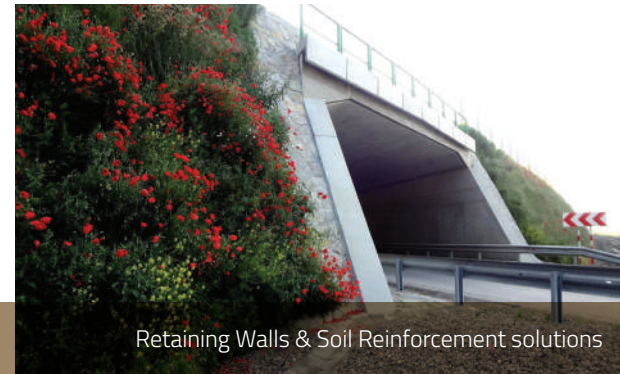
Retaining Walls & Soil Reinforcement solutions