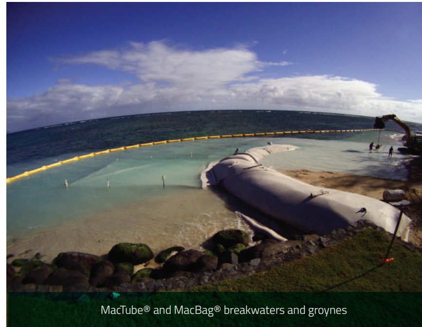
MacTube® and MacBag® breakwaters and groynes