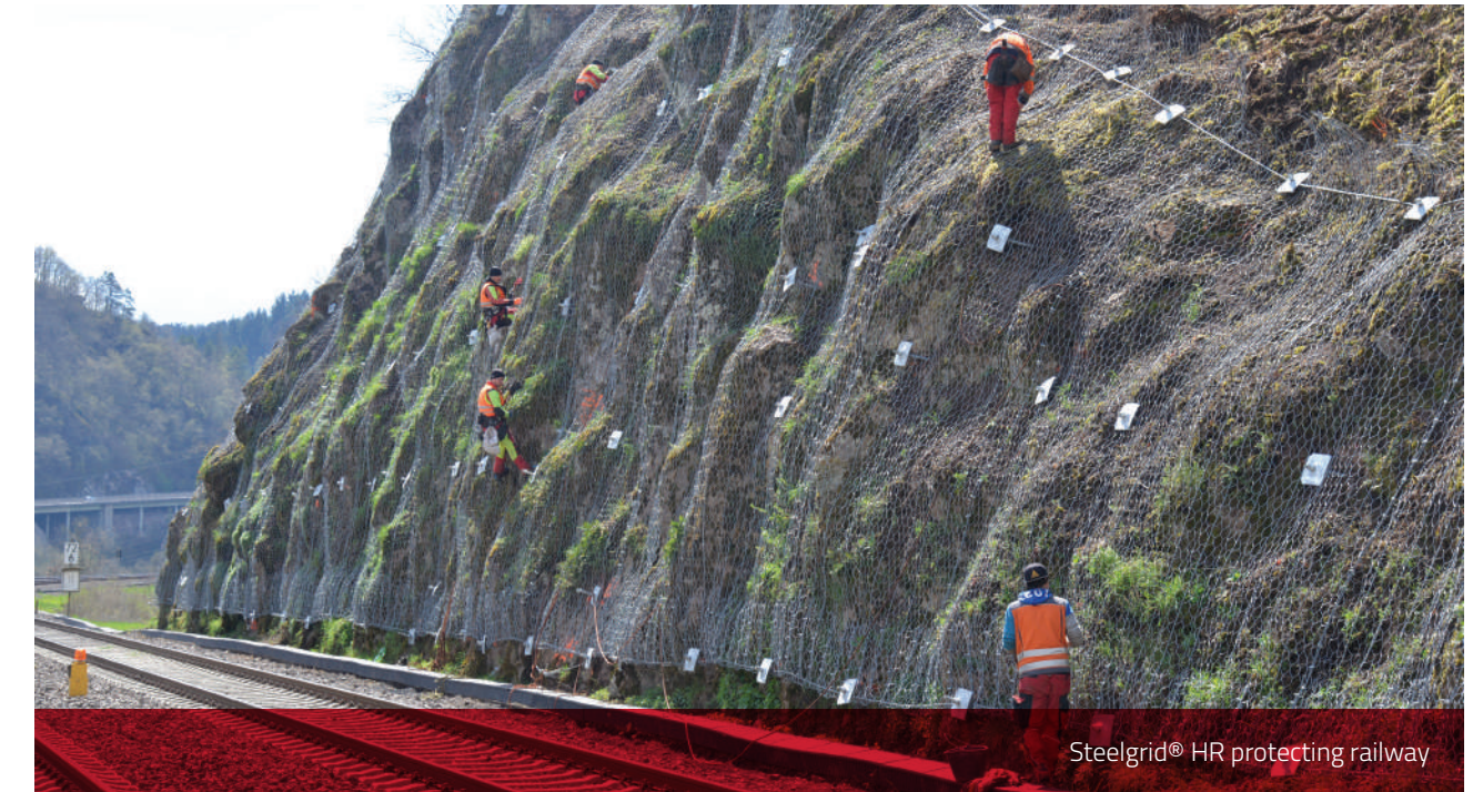
Steelgrid® HR protecting railway

A system of snow fence posts and anchors transmit forces from the snow pack into the ground.