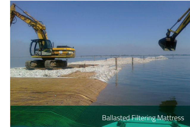
Ballasted Filtering Mattress