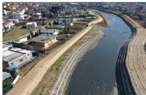
Channelling works containing river in urban area

Our MacLine® impermeable membranes and geosynthetic clay liners are often used to contain water within hydraulic works. They prevent water from draining away or cross-contaminating ground water. These geomembranes are often used in conjunction with our package of MacTex® geotextiles and MacDrain® drainage geocomposites.