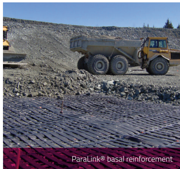
ParaLink® basal reinforcement