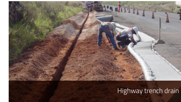
Highway trench drain

Our MacFLOW software resolves water-management challenges by enabling the design of the optimal MacDrain® drainage solution. The best value solution should not only address technical and economic issues, but also the environmental benefits and the speed and efficiency of installation.