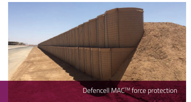
Defencell MAC™ force protection