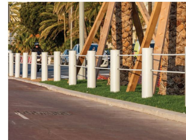
MacSafe™ on Promenade des Anglais, Nice, France