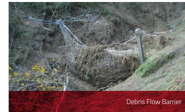
Debris Flow Barrier