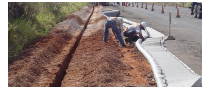
Soil stabilisation & pavement solutions