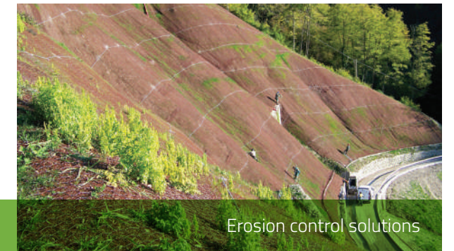
Erosion control solutions