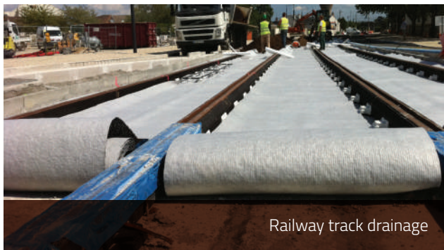
Railway track drainage

Providing a reliable drainage path beneath structures and sports pitches removes water which could affect the performance or lifespan of the structure above. Even when placed near-horizontally, MacDrain® provides good drainage function.