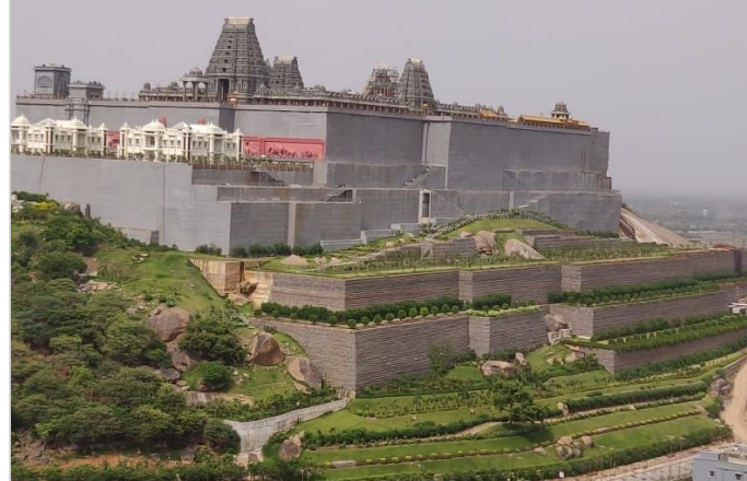
Fig 4: Paramesh system—post construction