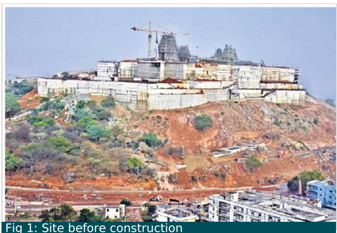
Tig 1. Site before construction