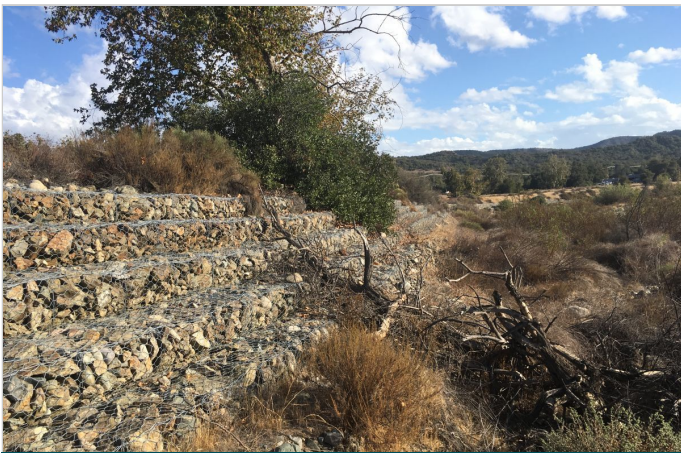
After Construction - 2018