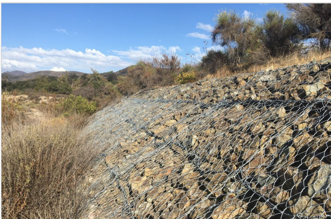
After Construction - 2018