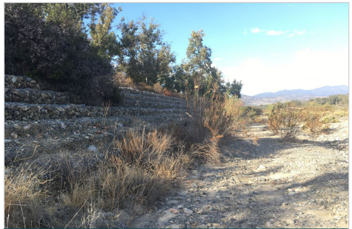
After Construction - 2018