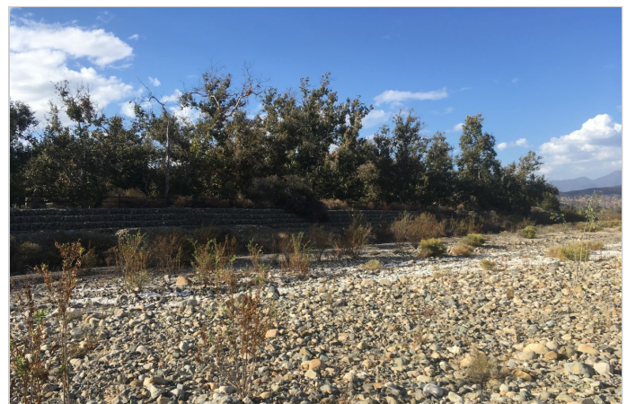
After Construction - 2018