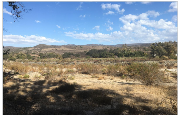
After Construction - 2018