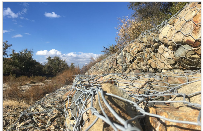
After Construction - 2018