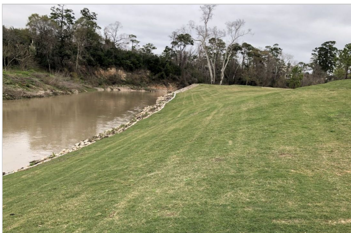
Beautiful winter growth after 3 months