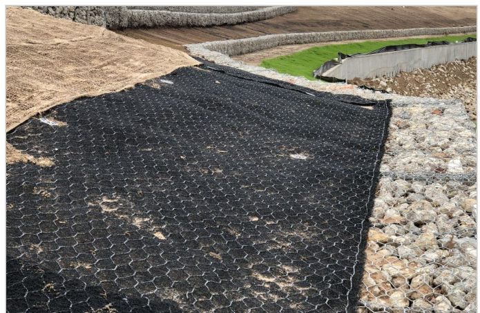
Easy connection to gabion baskets