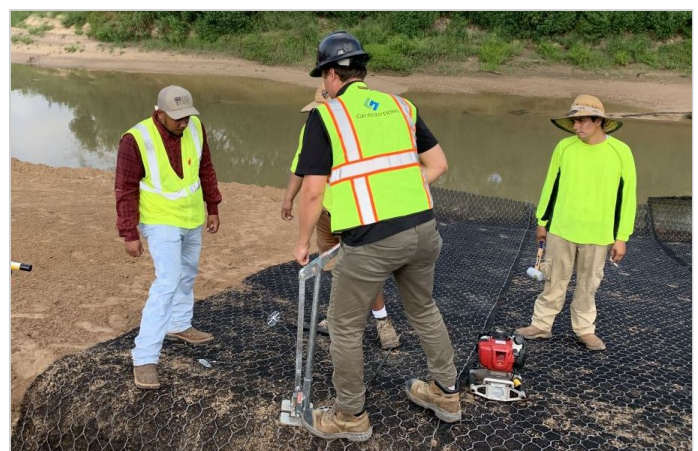
Installing the anchors