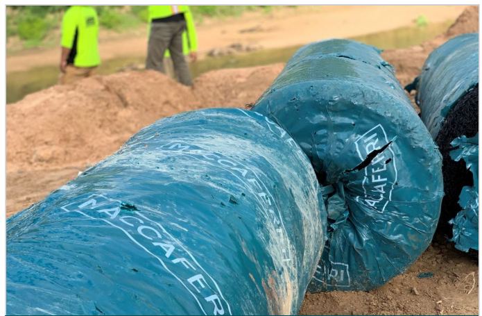
Materials on site - Ready to Begin