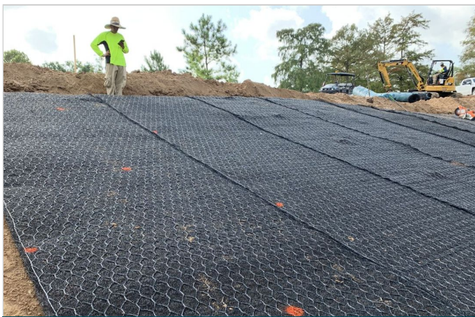
Anchor grid pattern