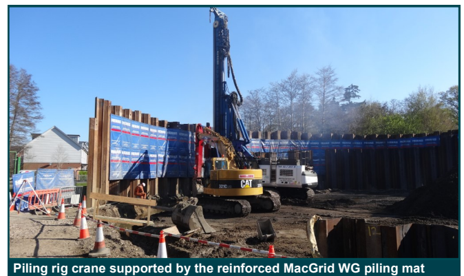
Piling rig crane supported by the reinforced MacGrid WG piling mat