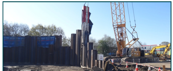
The Liebherr crane supported by the reinforced MacGrid WG piling mat