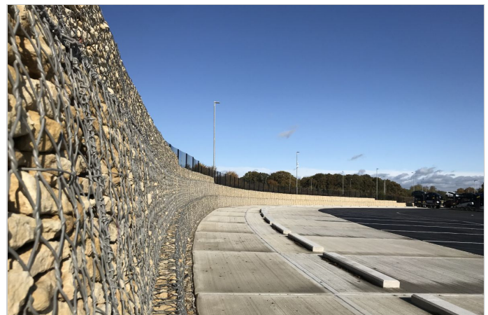
Gabion Terramesh wall edge view