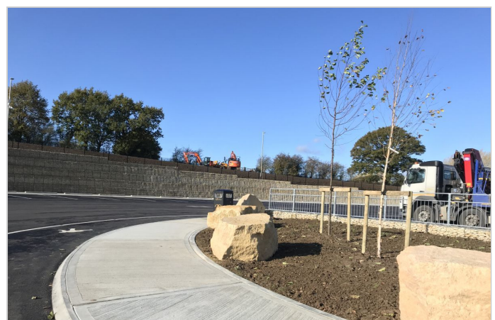
HGV driving into new expansion