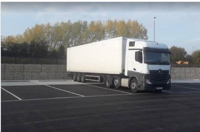
Successfully parked lorry