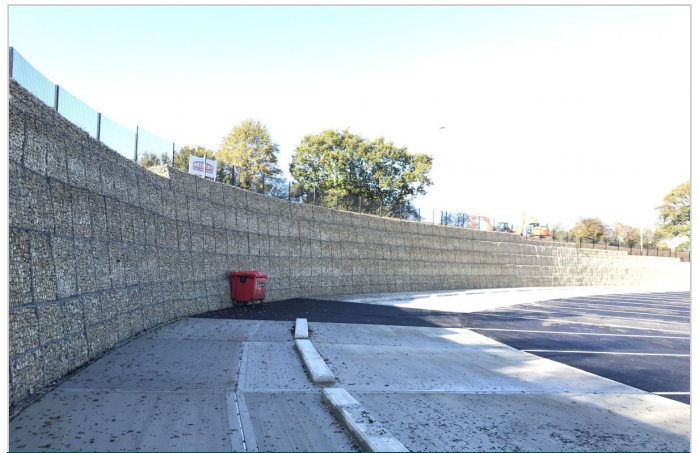
Wall at highest