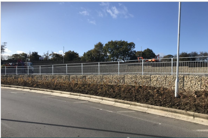
The shorter wall of gabions