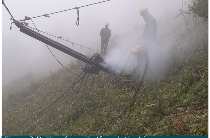
Figure 3-Drilling for nails (foundation) in progress