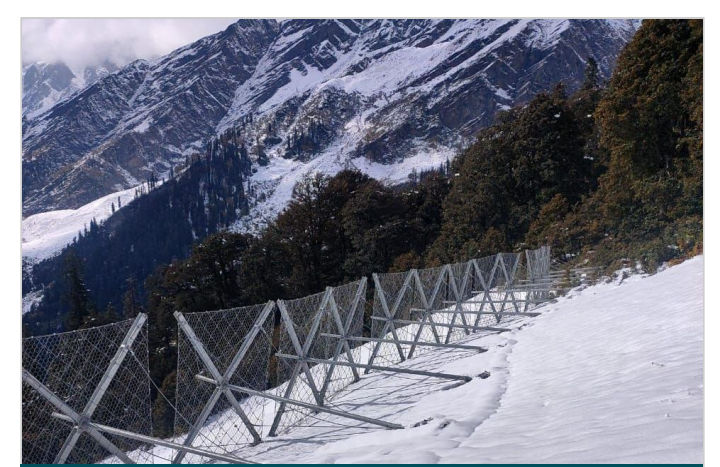
Figure 6-Multiple lines of Snow ErdoX lines installed (view from upslope during