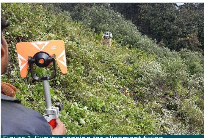
Figure 1-Survey ongoing for alignment fixing