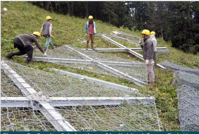
Figure 2- Onsite fabrication of individual Snow ErdoX