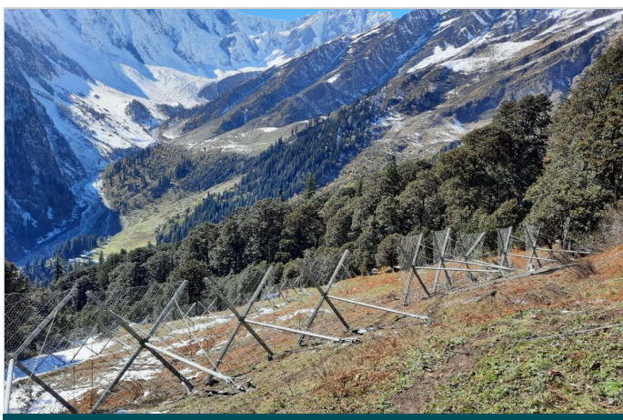
Figure 5-Multiple lines of Snow ErdoX lines installed (view from upslope)