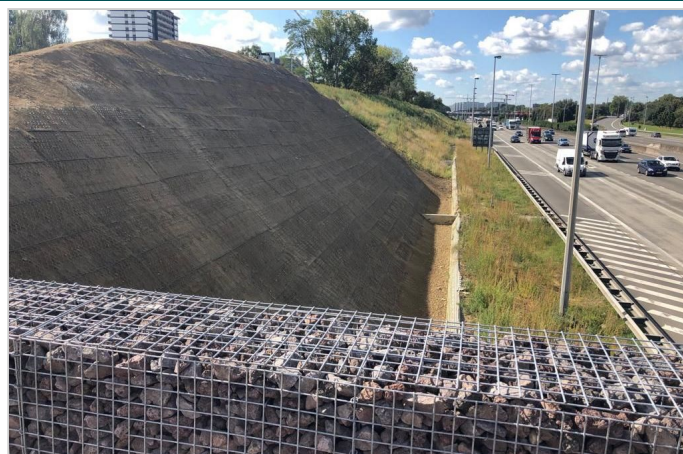
During the installation