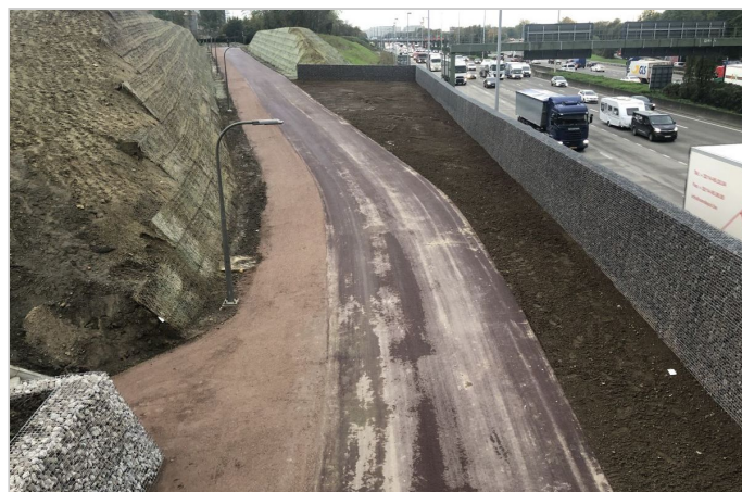
Detail of the welded gabion wall