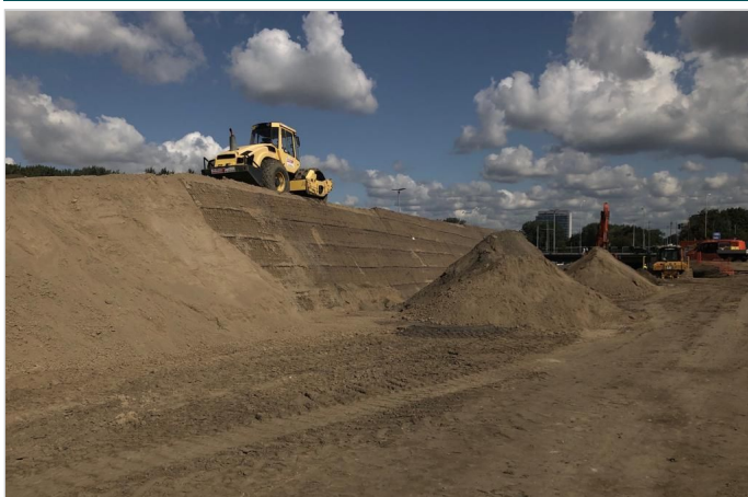
During the installation