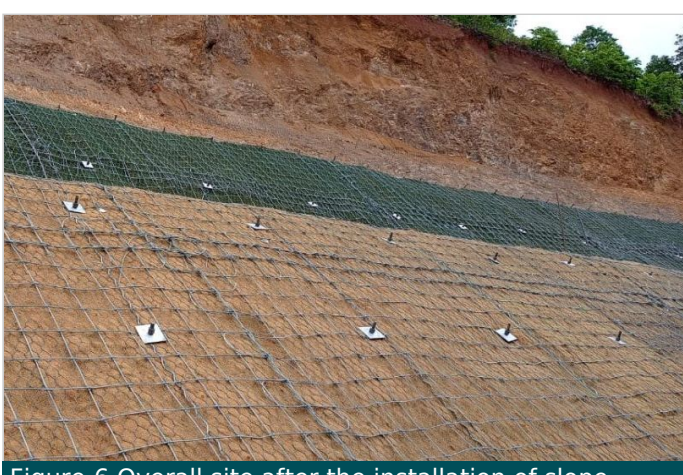
Figure-6 Overall site after the installation of slope protection system