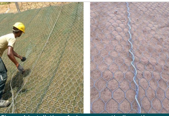
Figure-4 Installation of wire rope vertically on the edges of DT mesh