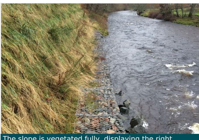
The slope is vegetated fully, displaying the right landscape