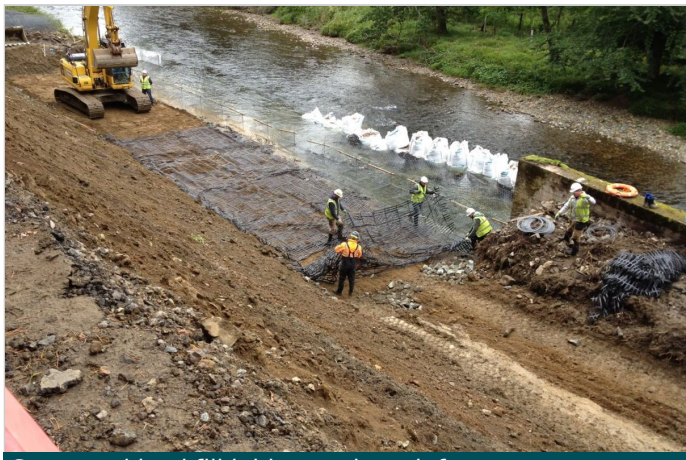
Structural backfill laid onto the reinforcement grids—ParaGrid