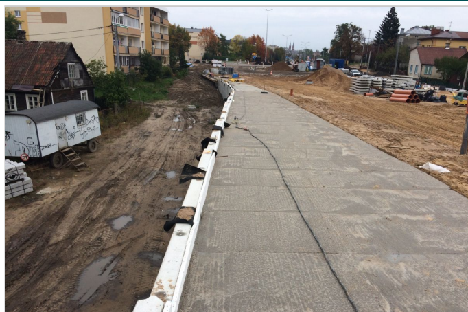
The buildings are located in close neighbourhood