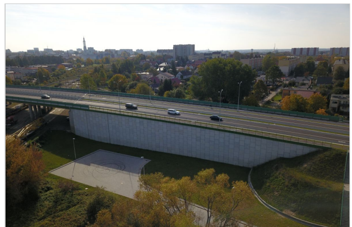
The jobsite was located in city center (close to the buildings)