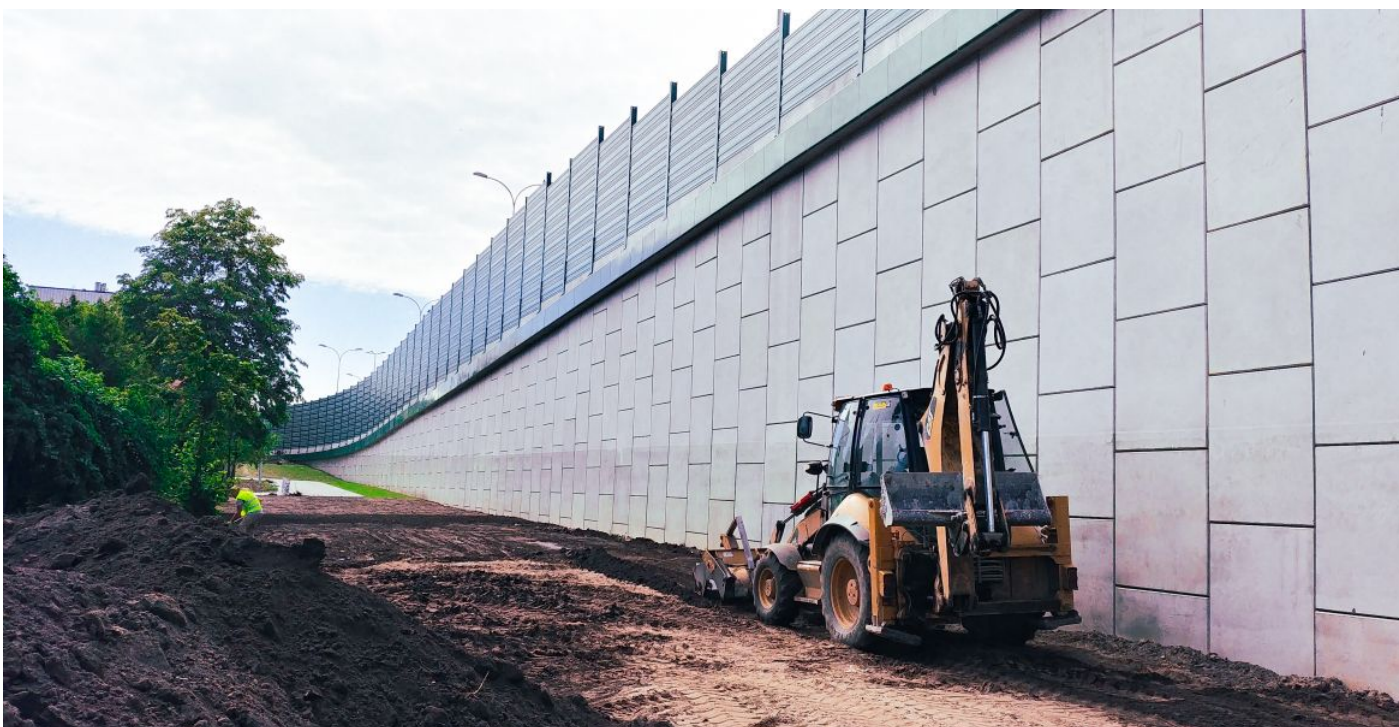
The MacRes construction has high aesthetically pleasant look