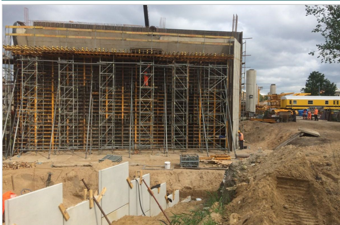
The abutments and MacRes walls were making simultaneously