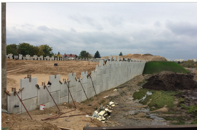
The panels were stored on previously completed MacRes Wall