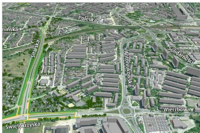
The visualisation of Sitarska Street