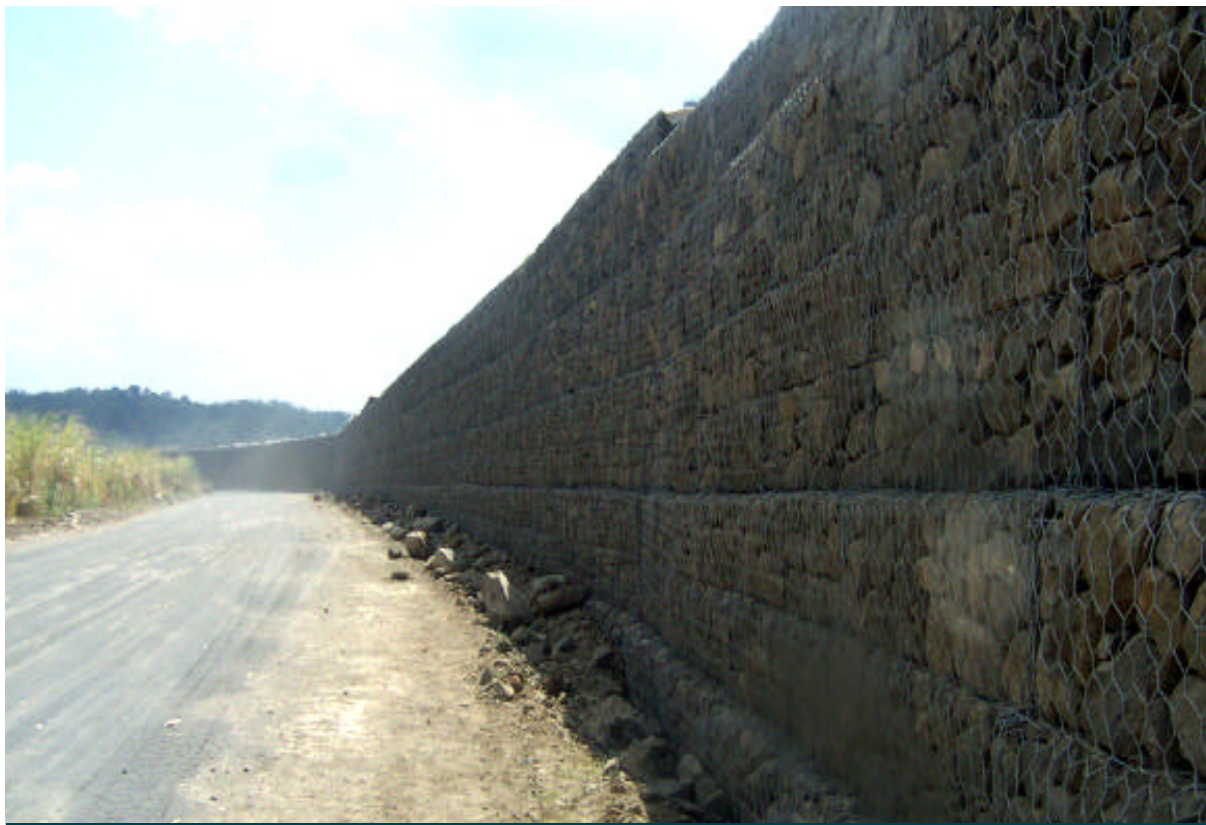
After Completion March 2003