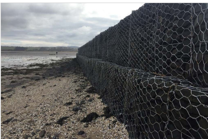
17 Years on since construction had finished