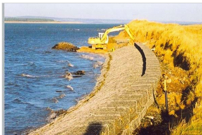
During Construction (High Tide)