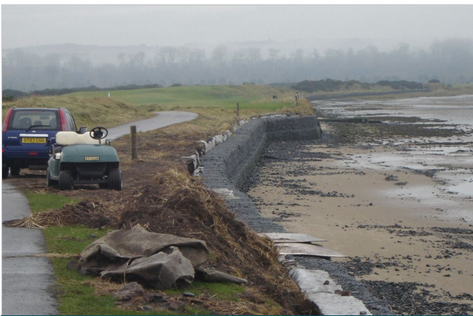
During Construction (Low Tide)