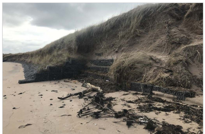
Growth over the Gabions