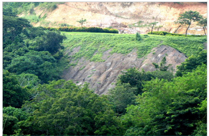
After 3 months