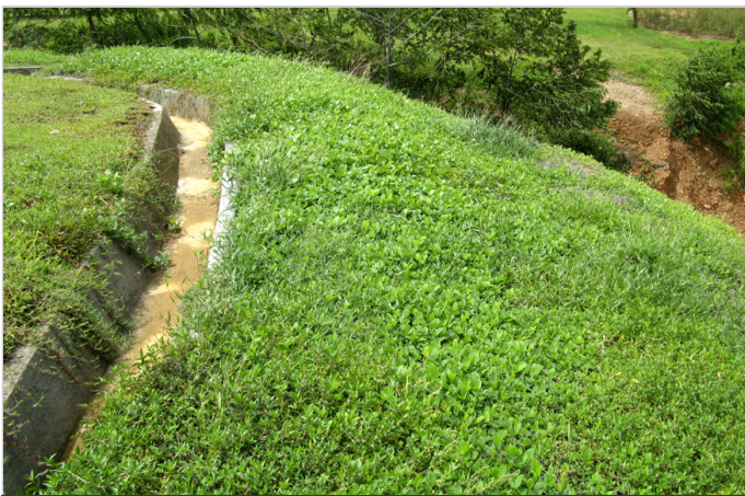
After 3 months