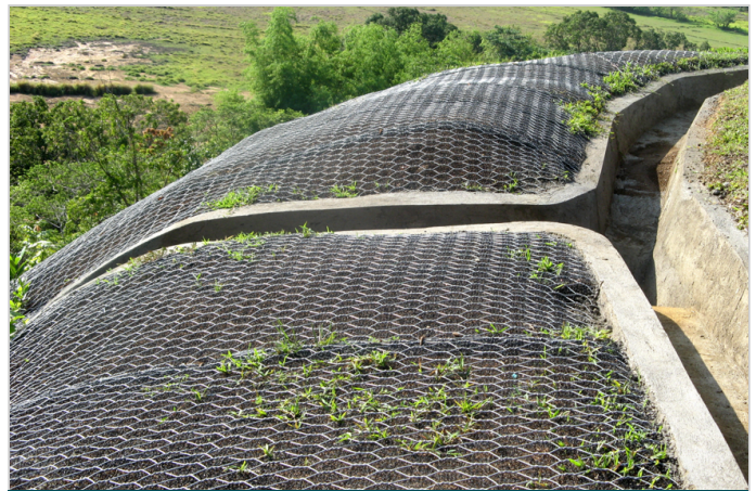
After 1 month