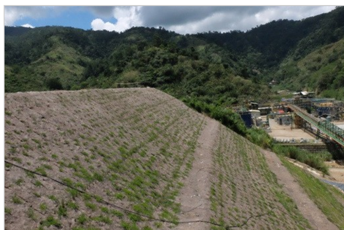
Natural Slope covered with Maccaferri Biomac for Erosion Control