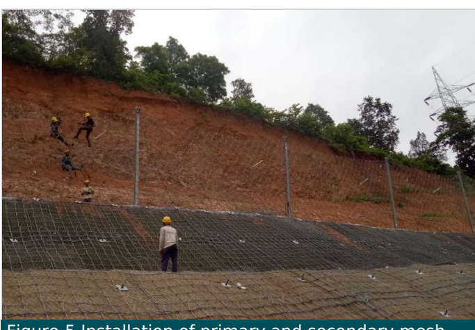
Figure-5 Installation of primary and secondary mesh (MacRing + DT mesh)