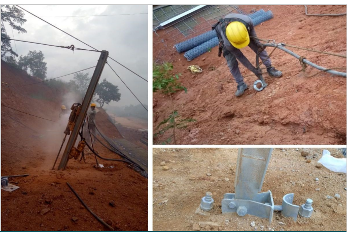
Figure-2 Activities related to installation of barrier posts