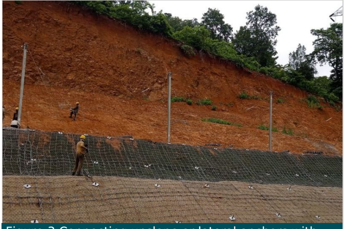
Figure-3 Connecting upslope or lateral anchors with help of bracing cables