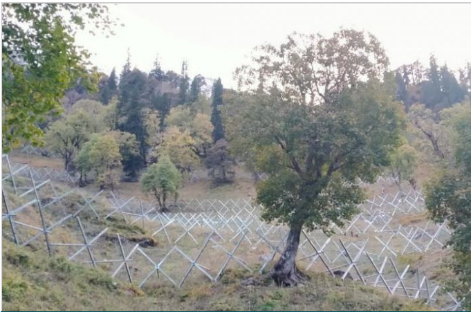
Figure 5-Multiple lines of Snow ErdoX lines installed