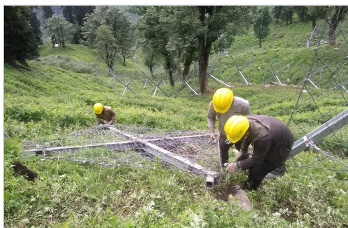
Figure 2- Onsite fabrication individual Snow ErdoX unit