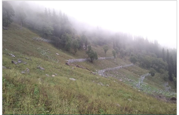
Figure 4-Multiple lines of Snow ErdoX lines installed