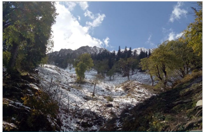
Figure 6-Multiple lines of Snow ErdoX lines installed