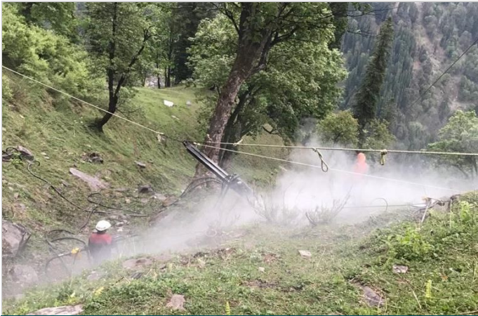
Figure 3-Drilling for nails (foundation) in progress