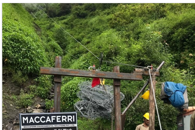
Figure 1-Winch arrangement for material transfer