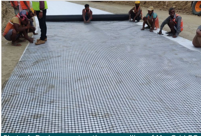
Photo 4: During construction - unrolling of MacGrid EG over MacTex