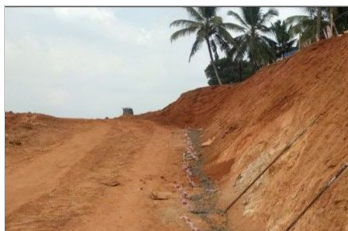
Initial site condition