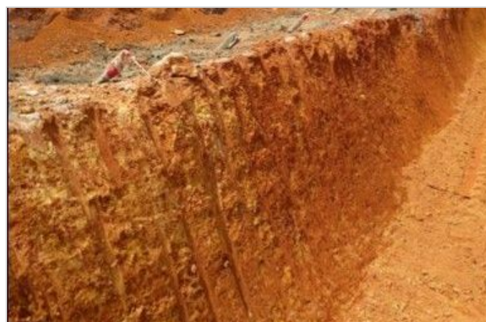
Excavated cut slope