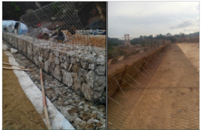
TMS and GTM installation