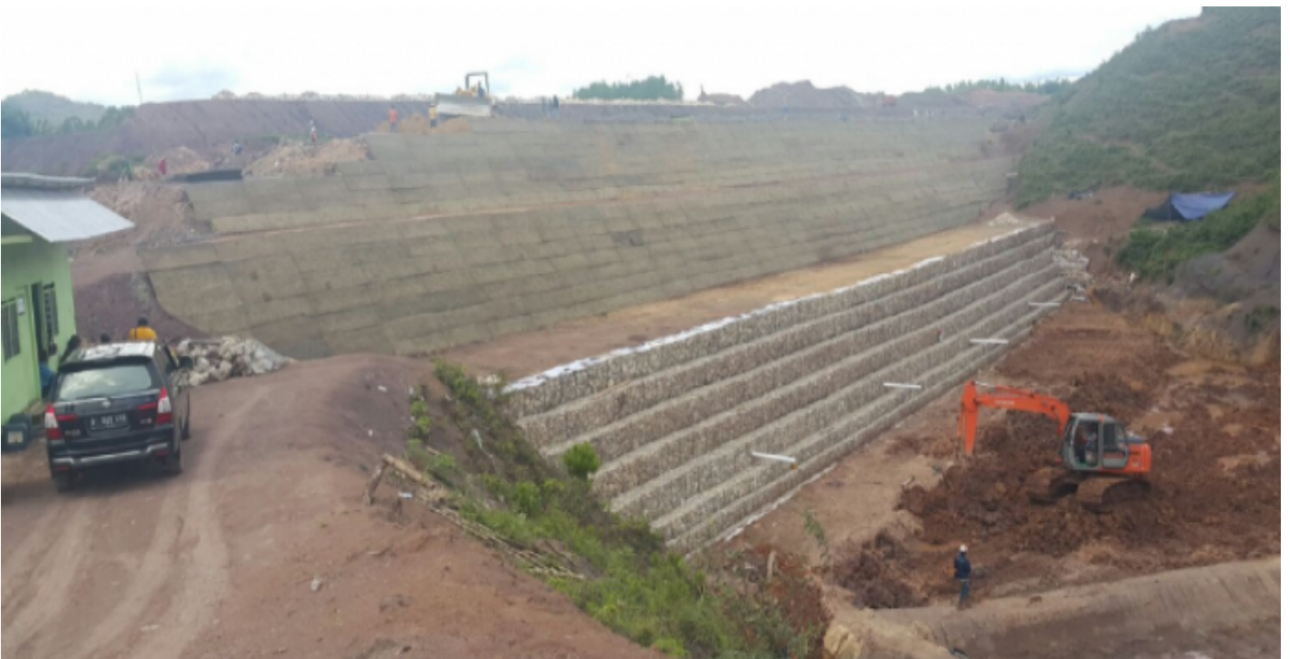
Stage 1, progress

Officine Maccaferri S.p.A. Via Kennedy, 10 40069 Zola Predosa (Bologna) Italy Tel: +39 051 6436 000 E-mail: info@hq.maccaferri.com