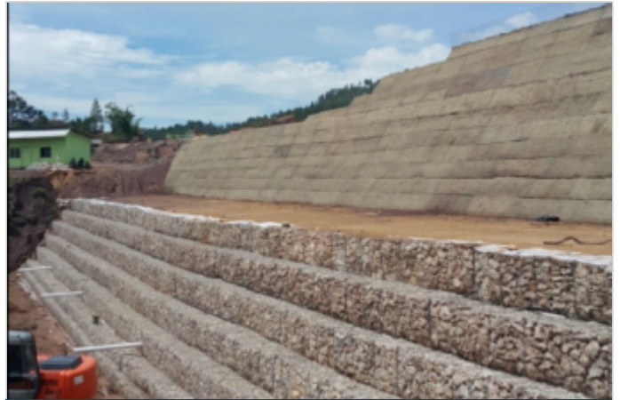
Stage 1 completed