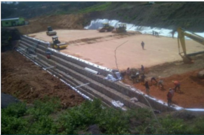
Stage 1, progress