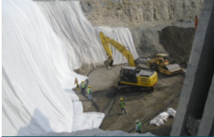
Installation of the filtering geotextile for the drainage system