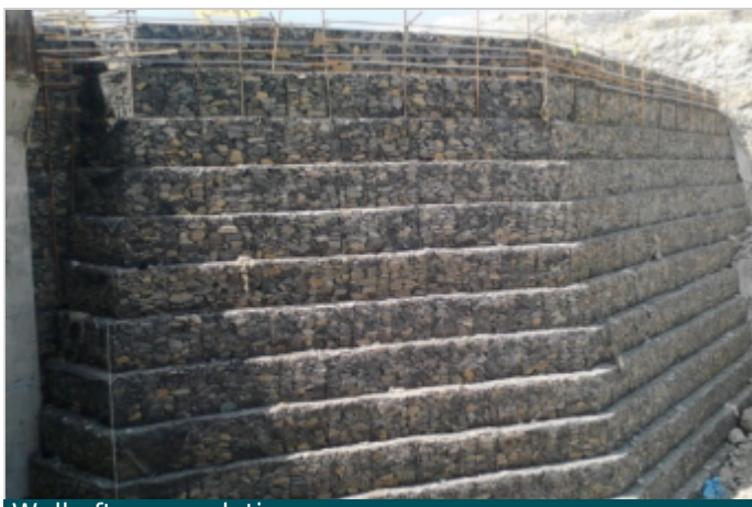
Wall after completion