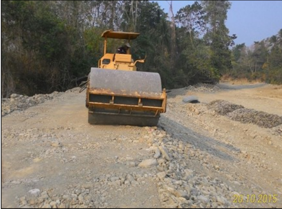
New dike construction