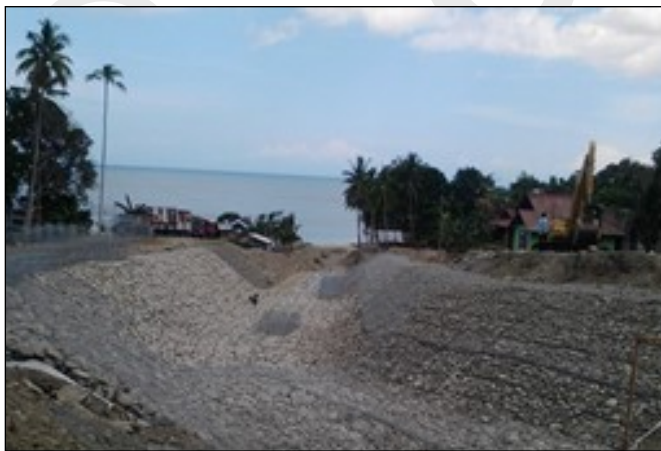
River revetment with Reno Mattresses under construction