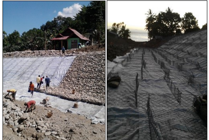
River revetment with Reno Mattresses under construction