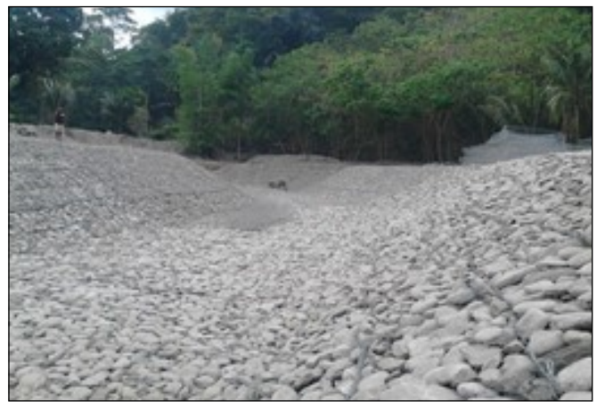
River revetment with Reno Mattresses completed