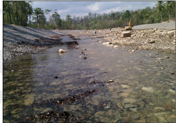
River revetment with Reno Mattresses completed