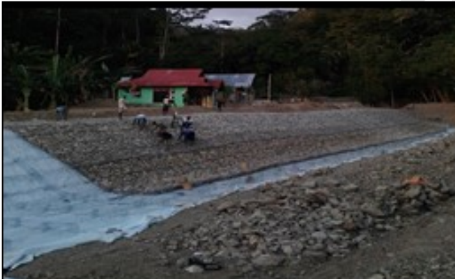
River revetment with Reno Mattresses under construction