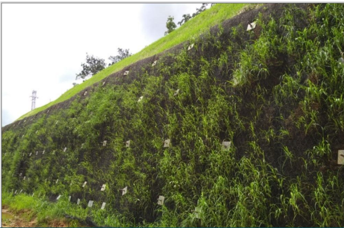
vegetated cut-slope face