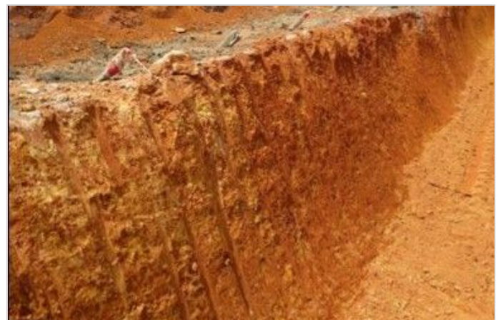
Excavated cut slope