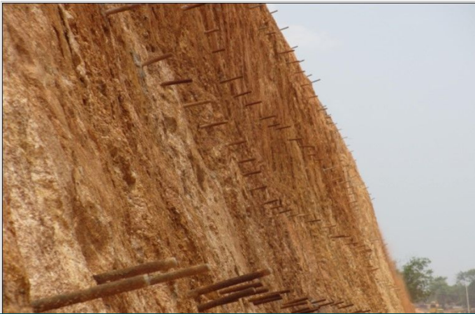
Installed Nails on slope surface