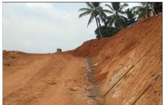
Initial site condition