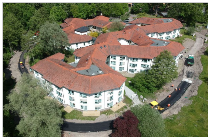
Drone aerial view