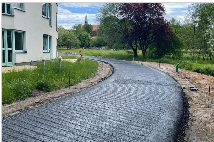
During the installation