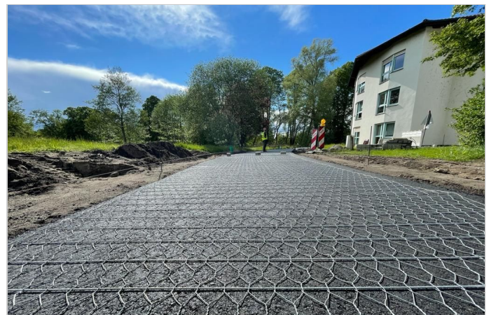
During the installation