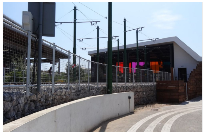
The new Tram Station with Maccaferri's TerraMesh™ system