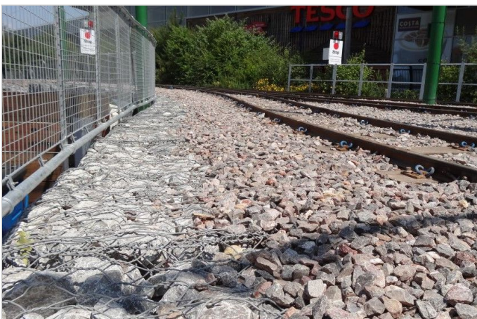
Top of TerraMesh™ system unit used also as ballast reinforcement