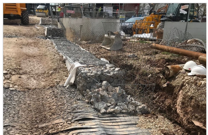
TerraMesh™ system placed over Paralink®