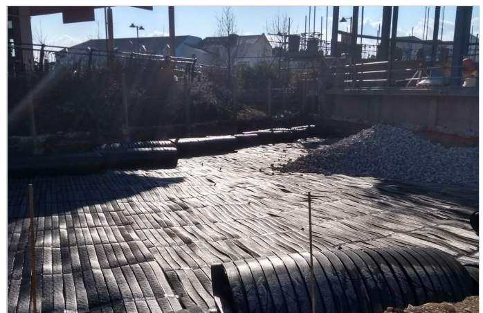
Paralink® being laid as basal reinforcement over CMCs