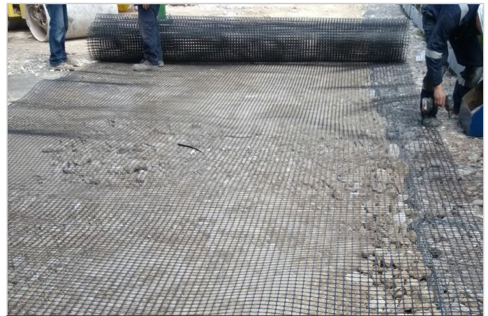
MacGrid EG L used as ballast reinforcement