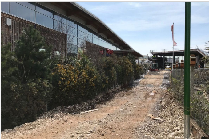
View of the developing TerraMesh™ embankment