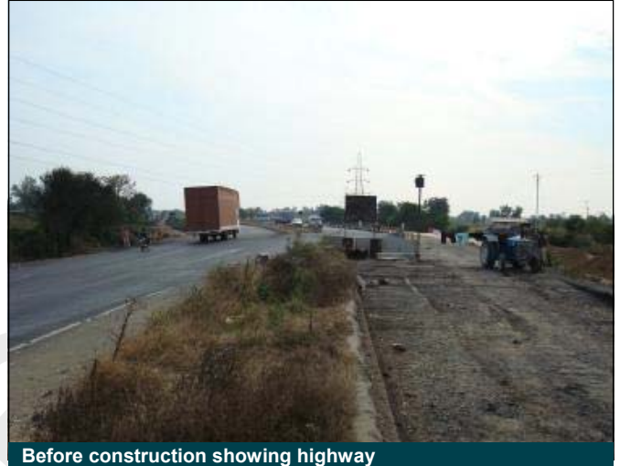
Before construction showing highway