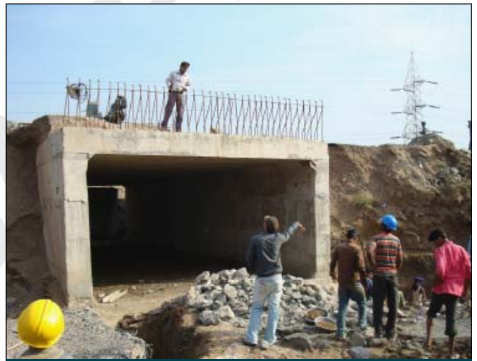
During construction of a culvert