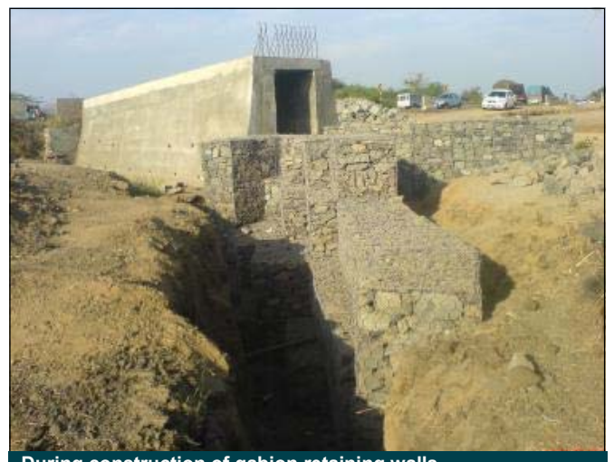
During construction of gabion retaining walls