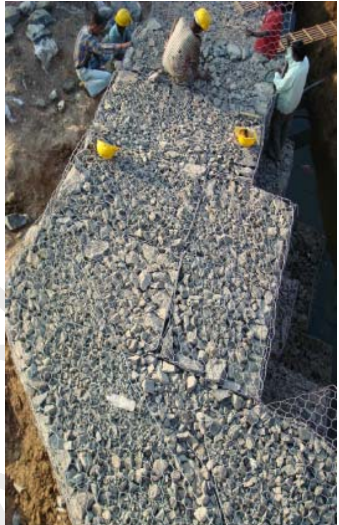
During Construction - Gabion layer, Placed on skew

The gabion walls were used as the standard solution for the multitude of culverts and crossings on the new highway.