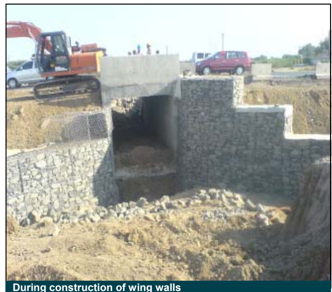
During construction of wing walls