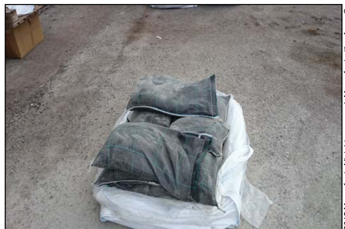
MacBag® units prior to filling

© 2015 Maccaferri. All rights reserved. Maccaferri will enforce Copyright.