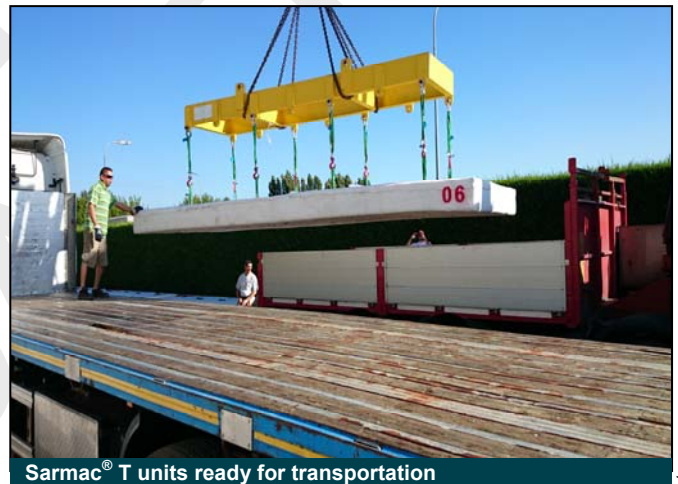
Sarmac® T units ready for transportation