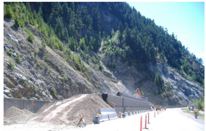
North End Access Ramp During Construction