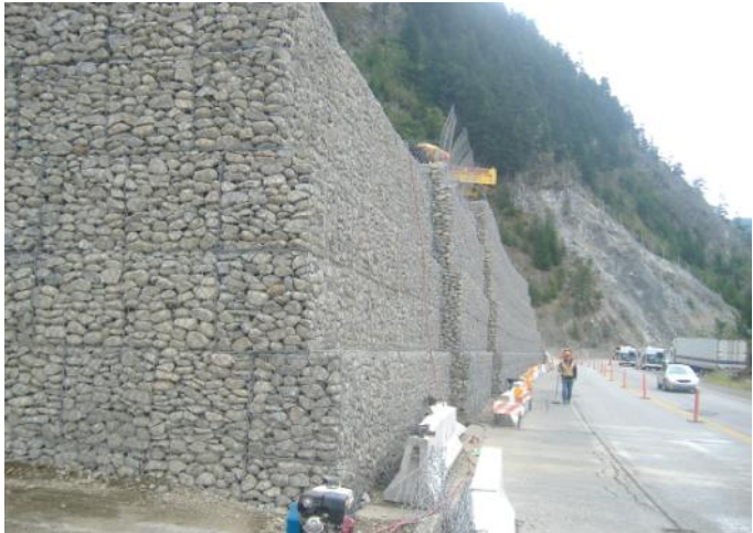
Completed North End of Structure

Passive Systems are solutions that do not stop rocks from detaching but rather intercept the falling debris as it makes its way down the slope in a controlled manner. They include various mesh drapery systems (Rock Mesh MO, HEA cable mesh panels and double twisted woven mesh), flexible rock fall barriers/fences and reinforced soil embankments (Green Terramesh® or Gabion faced).