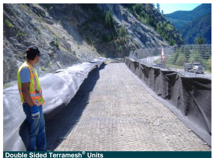
Double Sided Terramesh® Units