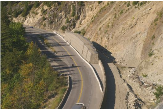
Completed Structure, August 2008