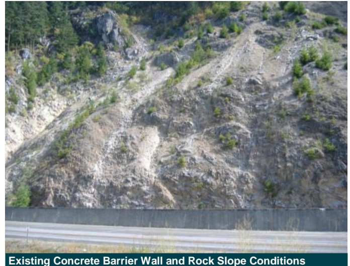
Existing Concrete Barrier Wall and Rock Slope Conditions