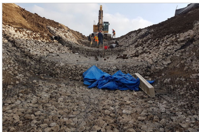
Detail of the constructions of the gabion mats