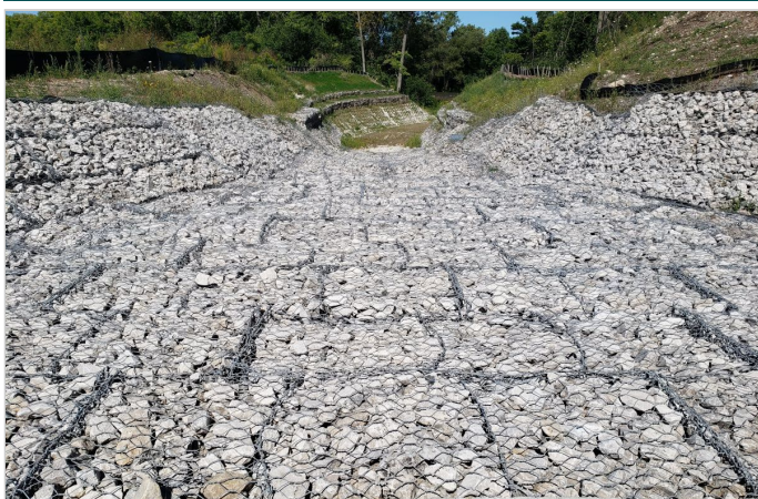
View of finished channel before vegetation establishment