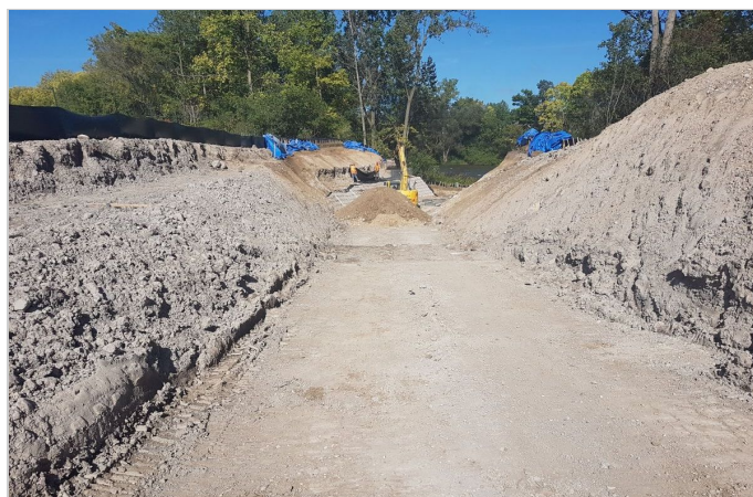
Earth work for the construction of the channel