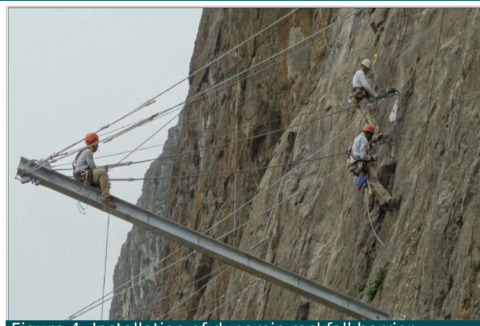
Figure 4- Installation of dynamic rockfall barrier