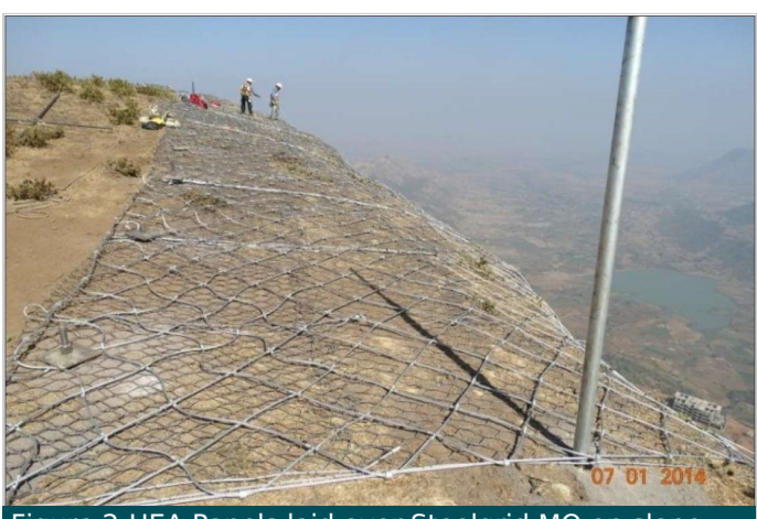
Figure 2-HEA Panels laid over Steelgrid MO on slope