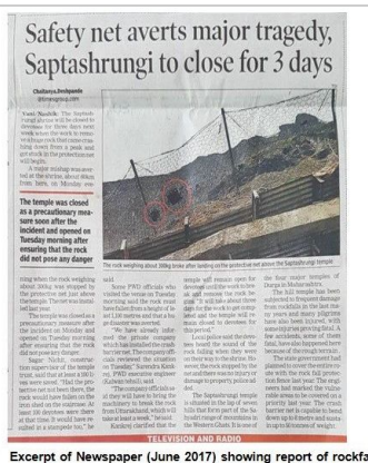
Excerpt of Newspaper (June 2017) showing report of rockfall event happened near Saptshrungi Gad which has been successfully contained by the dynamic Rockfall barrier