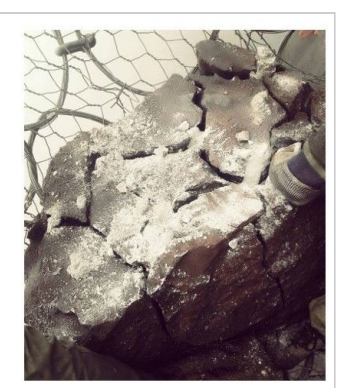
Breakage of rock pieces happening with the help of silent explosives (as part of maintenance activities