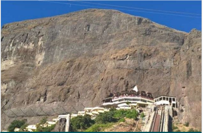
Figure 5-Completed scope of two lines of rockfall barriers and secured drapery s