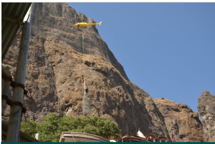
Figure 3- Helicopter used to transfer material during installation