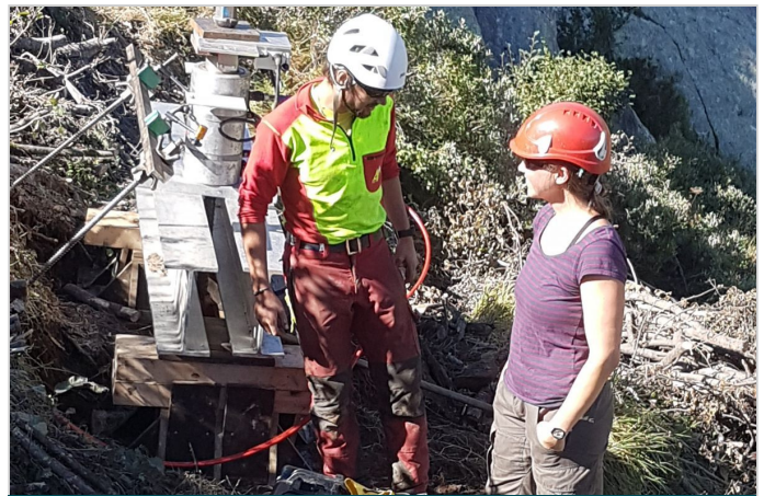
Site preparation and control