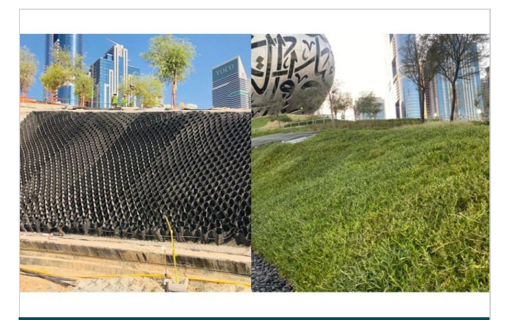
During construction: Macweb geocell (before & after vegetation growth)