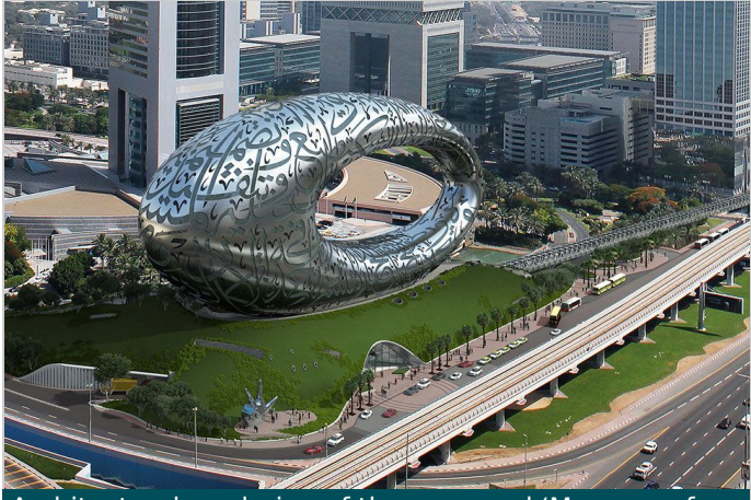
Architectural rendering of the proposed 'Museum of The Future' project