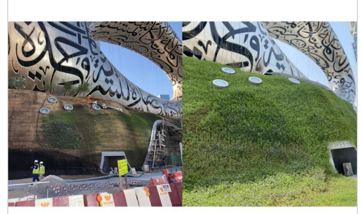
During construction: Green Terramesh soil slope (before & after vegetation)