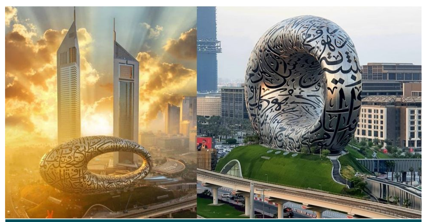
Completed 'Museum of The Future' project (distant & close views)

Maccaferri Middle East Dubai PO box 502594 United Arab Emirates Tel:+97143608958