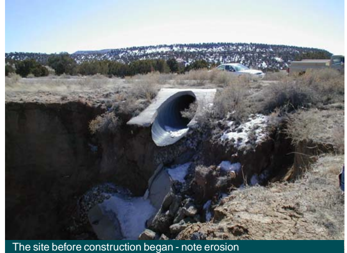
The site before construction began - note erosion

The entire installation was constructed upon MacTex MX415 geotextile. This is important to limit fine soils from washing out from beneath the structure.