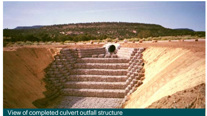
View of completed culvert outfall structure