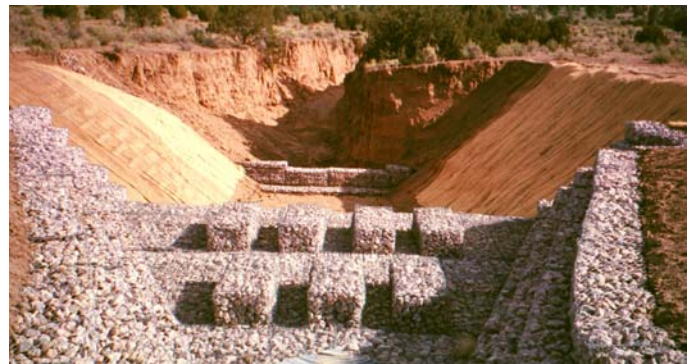
View towards gabion check dam