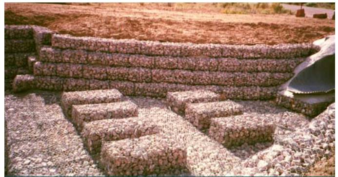
Gabion dissipator blocks at culvert outfall

This characteristic of the double twist hexagonal mesh is vital, particularly in critical infrastructure applications where there is the potential for differential settlement.