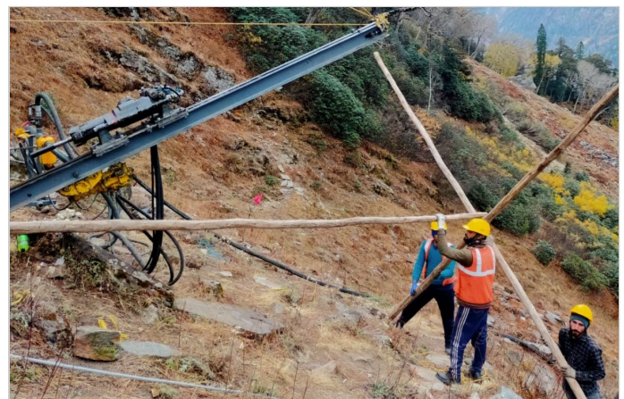
Figure 2- Positioning of Snow ErdoX units using wooden template