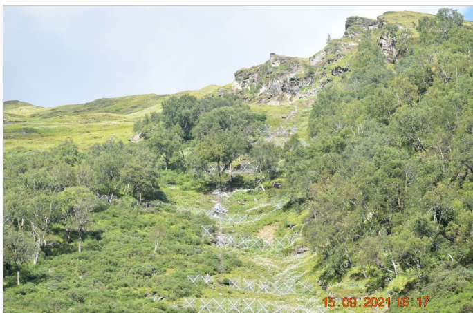
Figure 5- Multiple lines of Snow ErdoX units installed left gully at MSP 12