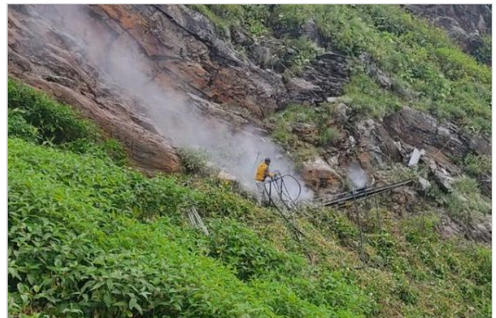
Figure 1- Drilling for nails (foundation) in progress