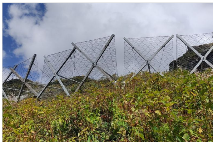
Figure 4- Execution in progress