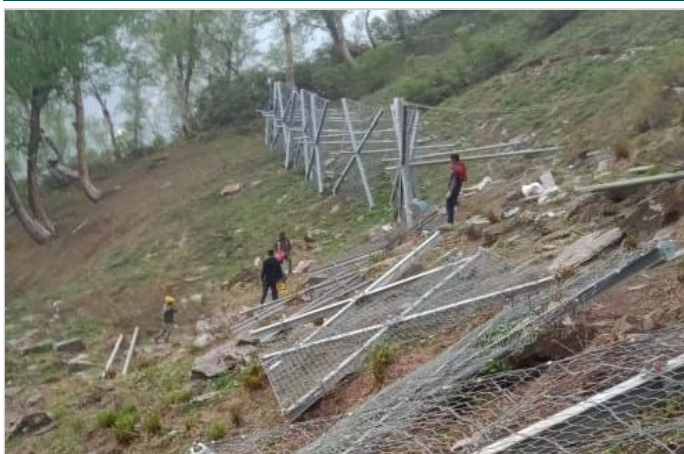
Figure 3- Onsite fabrication of individual Snow ErdoX unit