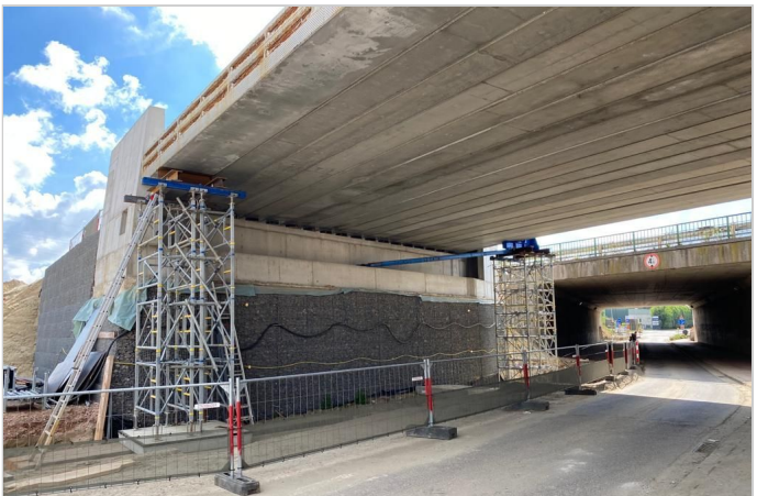
K02B supporting the road-bridge