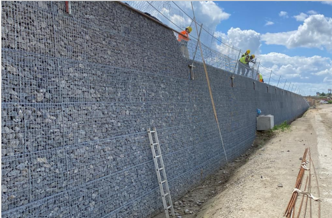
G01 wall - side view of Mineral Terramesh wall