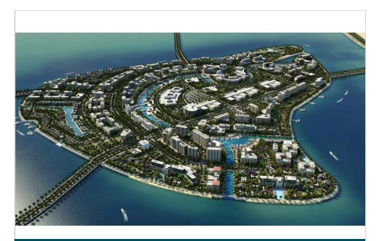
Architectural rendering of the proposed Dilmunia Grand Canal & Marina Project