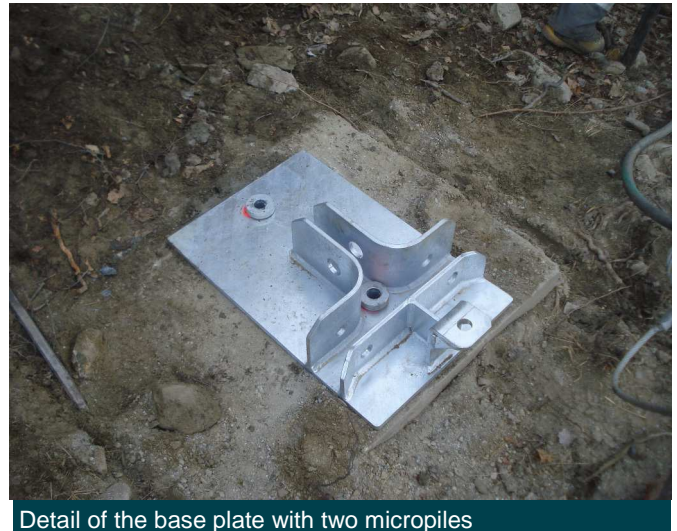
Detail of the base plate with two micropiles