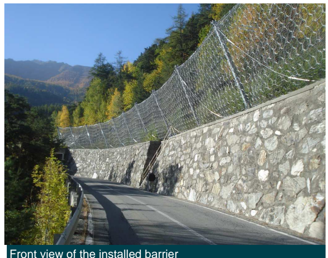
Front view of the installed barrier