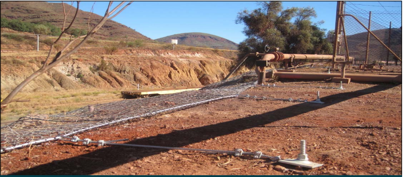
Installation, showing crest line and anchorages

Project specialist contractor, Specialised Geo, attached weights at the toe of the slope in Zone 3, to prevent the mesh lifting away from the slope and providing the necessary dampening effect should a rockfall detachment occur.