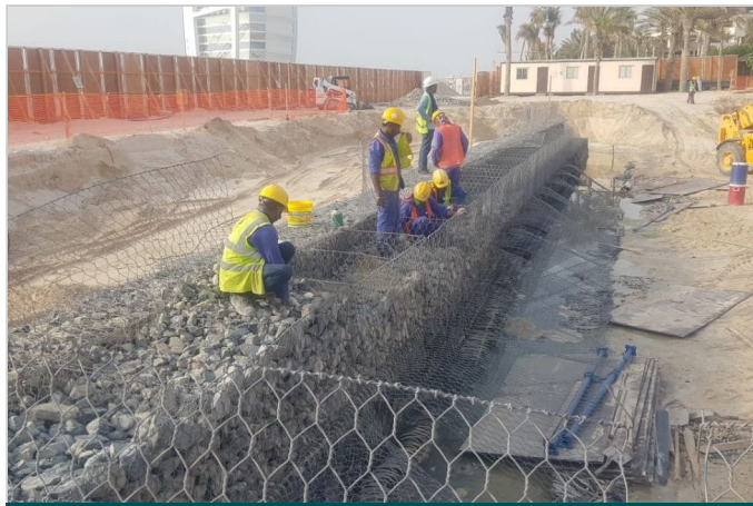
During construction: terramesh & Gabion protection walls in progress