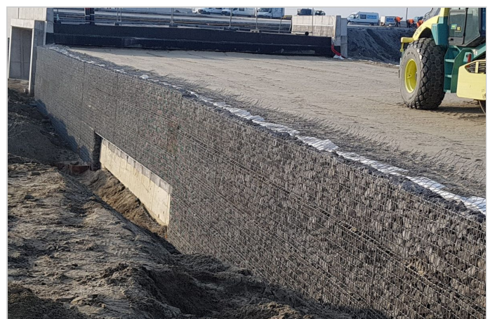
During the installation