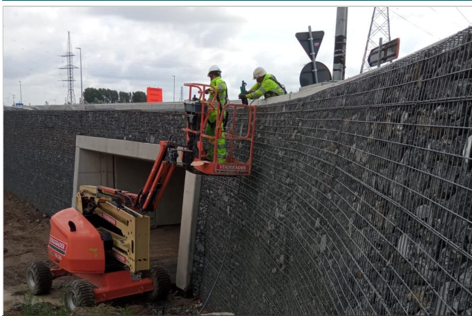
Construction phase: side view detail