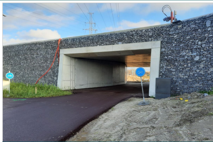
After installation - bridge detail