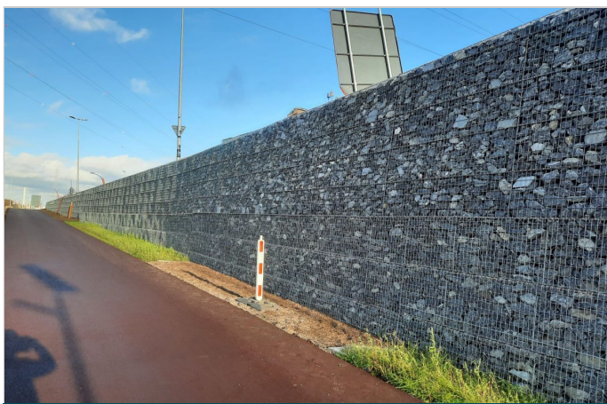
Side view detail