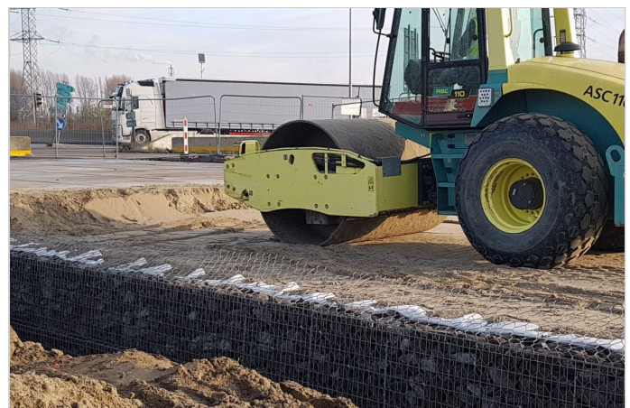
During the installation