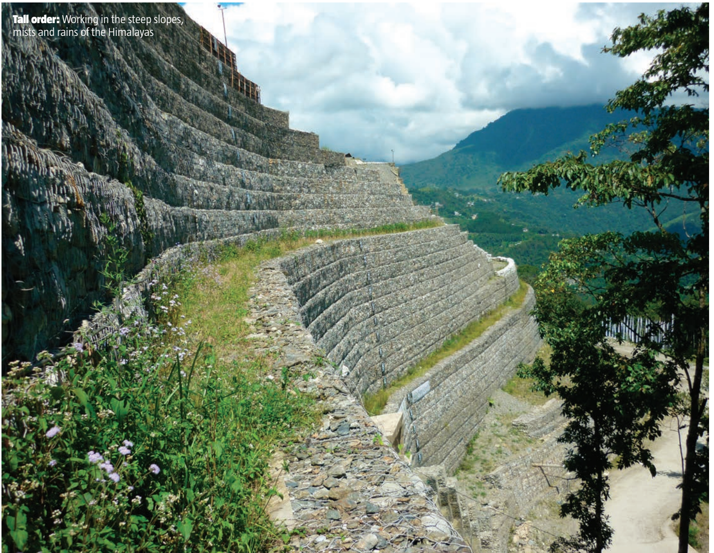
Tall order: Working in the steep slopes, mists and rains of the Himalayas